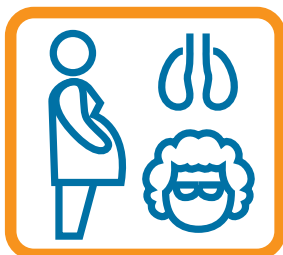
Stay home if at higher risk