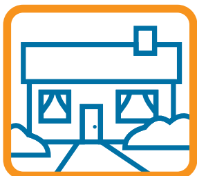
Stay home if sick

To limit Coronavirus/COVID-19 in DC Ranch, please adhere to guidelines from the Public Health Authorities